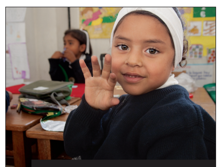
IN PISCO ALONE, HUNT GLOBAL PARTNERSHIPS WORKED WITH OVER 12,000 STUDENTS, LIKE THIS YOUNG GIRL, TO IMPROVE THEIR OVERALL ACADEMIC ACHIEVEMENT.

HGP recognized the fundamental importance of the family in children's education in Peru. That's why the "Successful Schools" program worked with over 3,000 parents in a Home Curricula Workshop that included tactics such as "A Place to Study" and the "Storyteller." "A Place to Study" was designed to offer students an adequate study area at home with appropriate lighting. "The Storyteller" encouraged mothers to read to their children often, using the traditional "bedtime story" as a vehicle of learning through which the mothers can teach their kids new words and phrases.