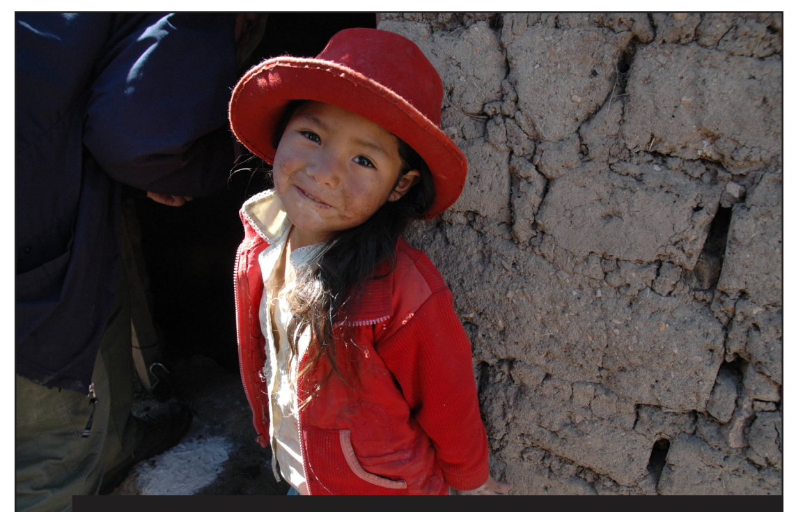
THIS HIGHLAND GIRL'S TRADITIONAL WAY OF LIFE WILL NOT INCLUDE ALL THE TRADITIONAL PROBLEMS OF GENERATIONS PAST, THANKS TO THE PROJECTS HER COMMUNITY PURSUED WITH HUNT GLOBAL PARTNERSHIPS.

and can now proudly report that the results of our model have been astounding. The statistics are conclusive and the personal stories from community to community express the local empowerment and true shared value that has been developed for the people in this region. Having served 124 communities and approximately 50,000 people in Peru, Hunt Global Partnerships is committed to providing sustainable, adaptable, accountable and transparent programs that yield real results and make a positive difference.